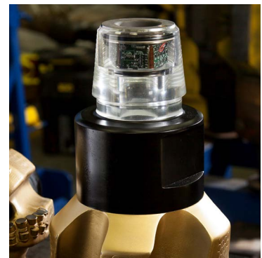
MultiSense HD is a self-contained and self-activated in-bit drilling dynamics module.