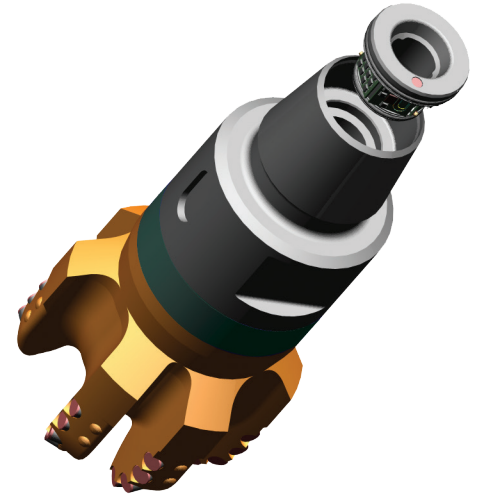
Multi-sense HD module provides an understanding of bit rotation and vibrations with a statistical summary every 3 seconds.

Contact your Baker Hughes representative to learn how Sabio Drilling Insights can improve performance on your next well.